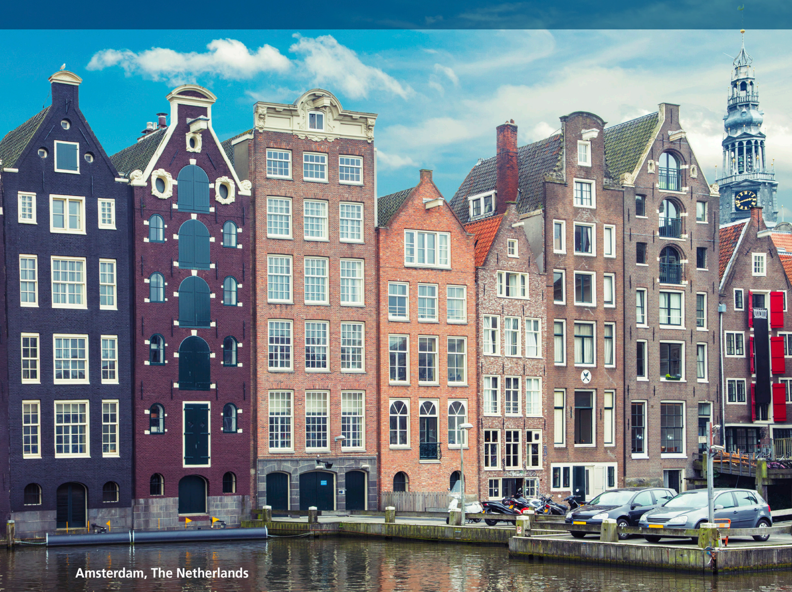
Amsterdam, The Netherlands