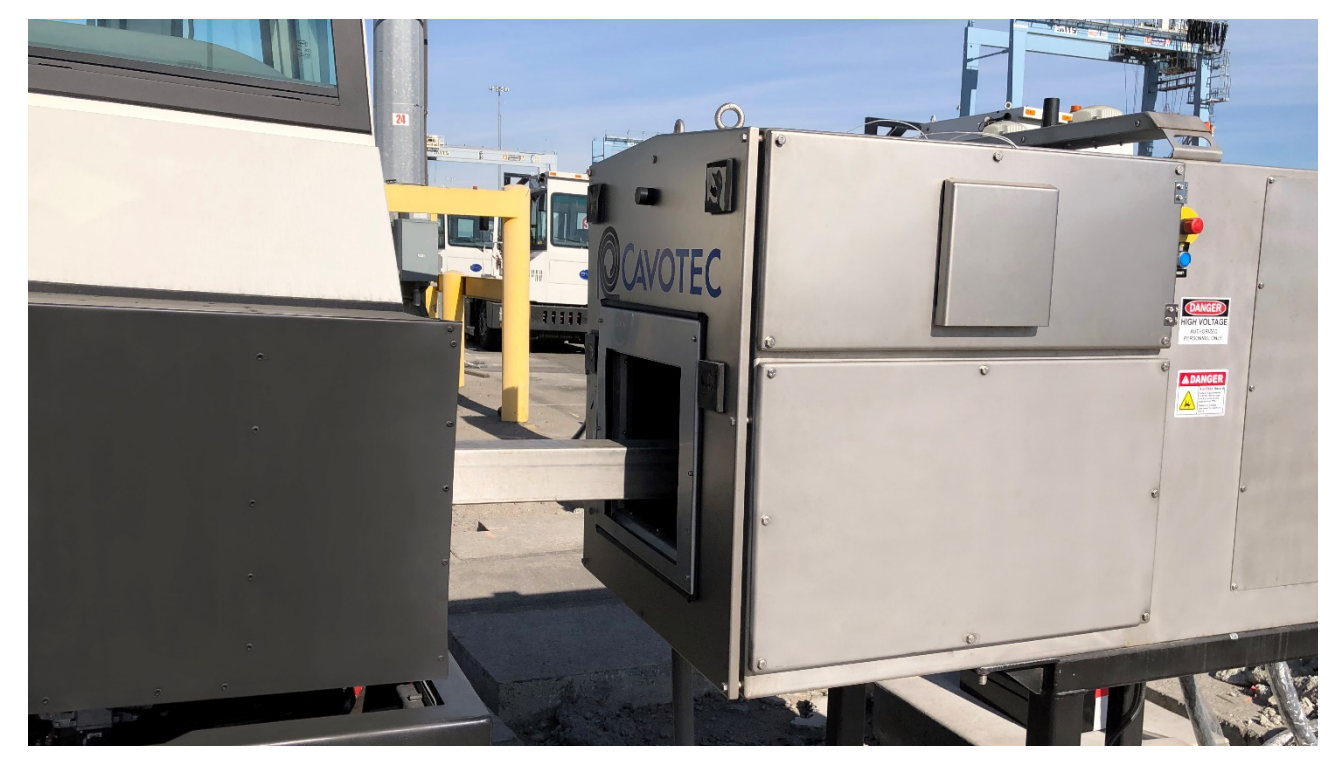
Cavotec e-truck charging wins the American Association of Port Authorities (AAPA) 2020 Facilities Engineering Award.