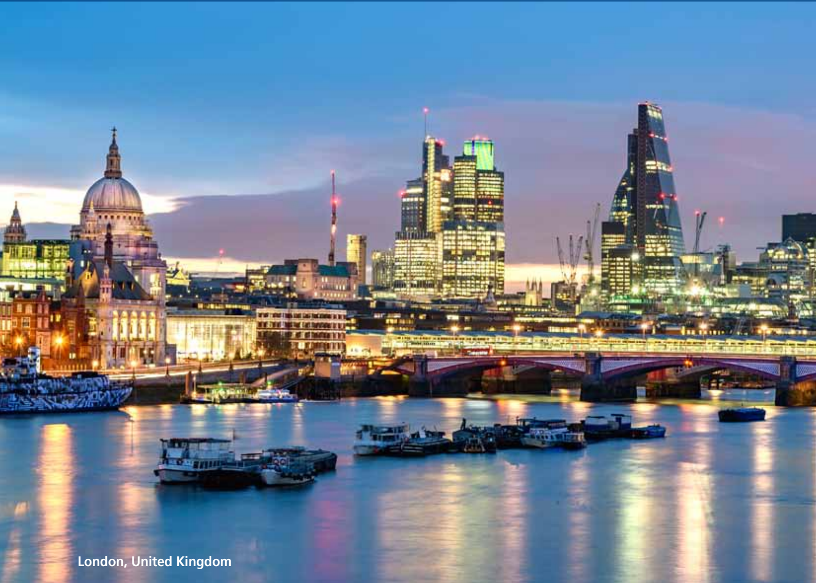
London, United Kingdom