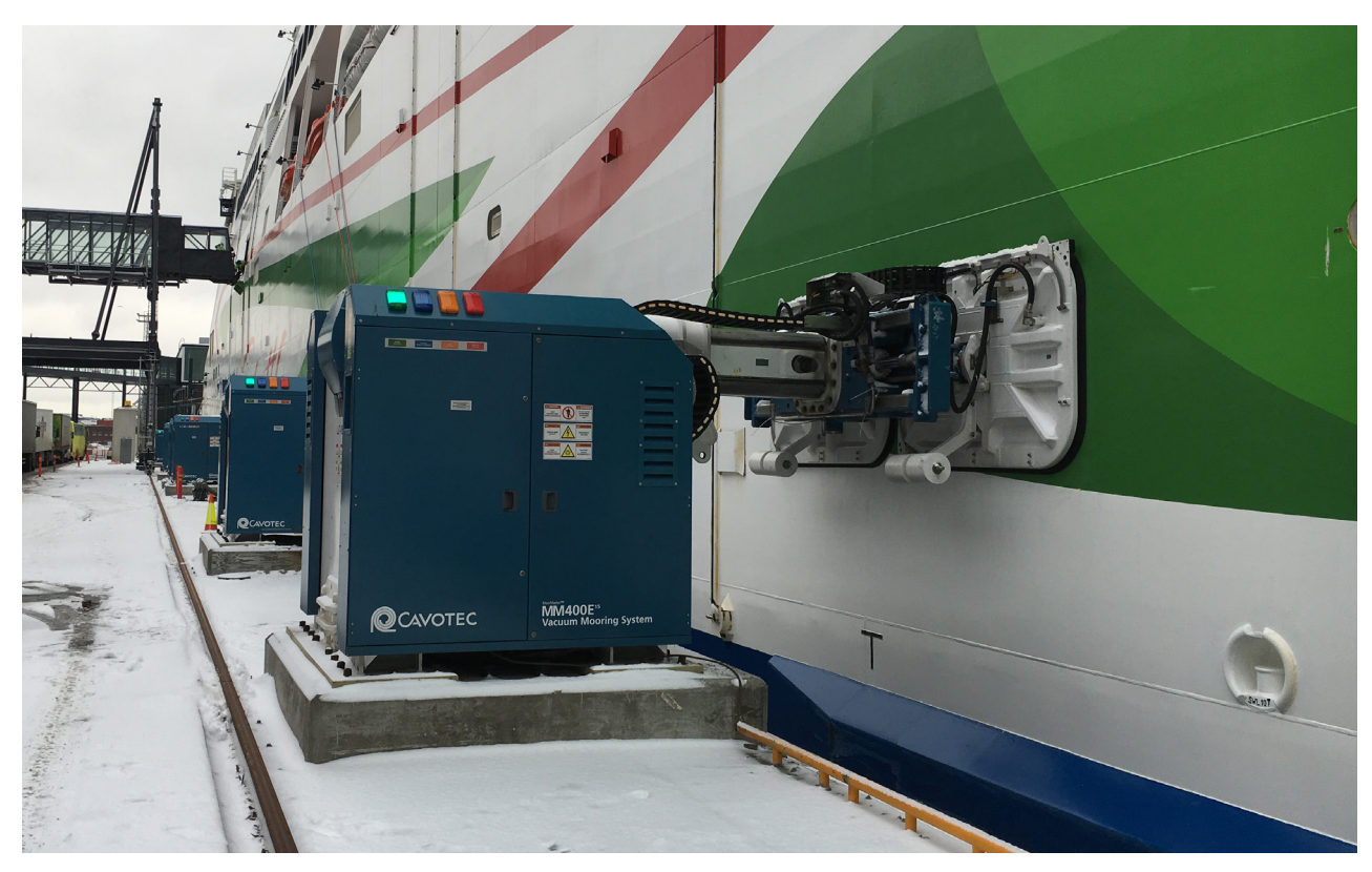
Cavotec reaffirms leadership in automated mooring with new order in Finland. Shown in picture, a similar system at Port of Helsinki in service since 2016.

Earnings per share, basic and diluted, increased to EUR 0.023 (-0.08).